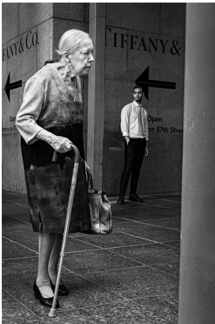
The Way to Tiffany