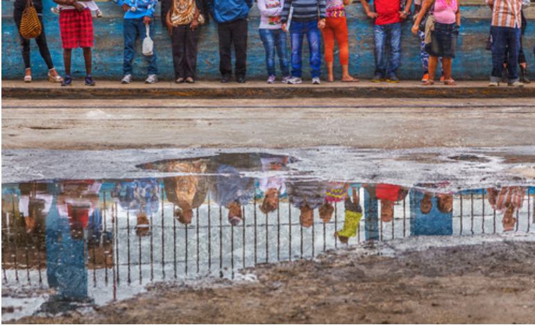
Waiting for the bus in Havana

If you could give your beginner self a piece of advice from what you know now - what would you say?